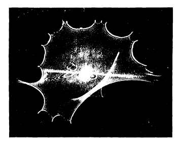
Caustics formed in the far field by a broadened laser beam incident on a water drop 'lens'.