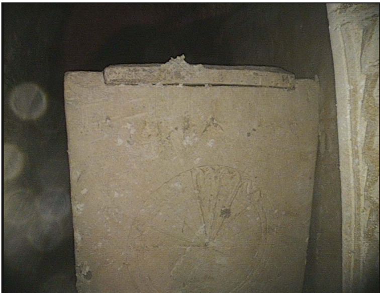
FIG. 3. Ossuary from Tomb 1 with the Greek inscription.