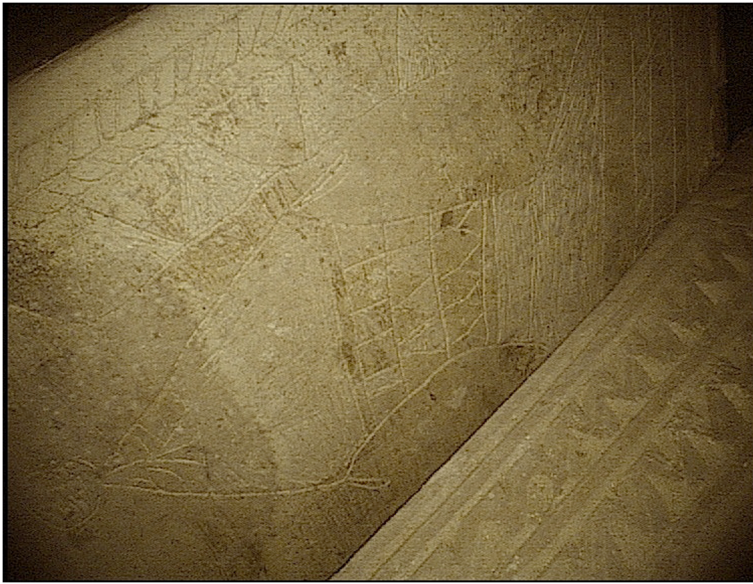
FIG. 1. Front left half of Ossuary #1 (unenhanced photograph, rotated).

upper case Greek script. The first three lines appear to read: 7