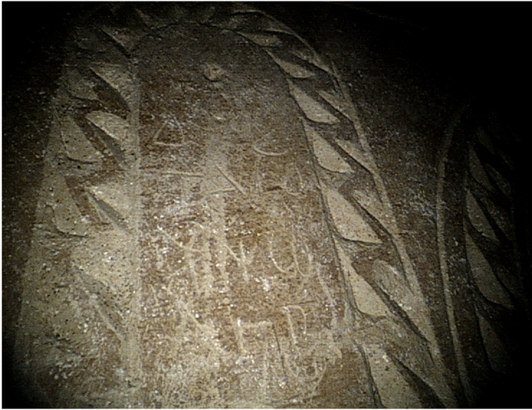
FIG. 2. Front of Ossuary #2 (unenhanced photograph) showing four-line inscription between rosettes. The fisheye distortion in this image is due to narrowness of the passage between that ossuary and the niche's wall.