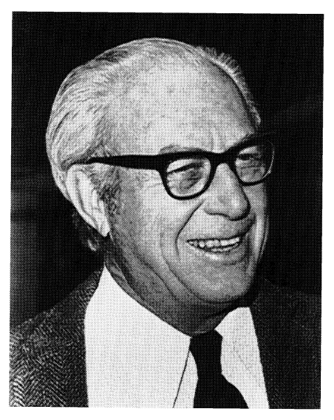
Edwin F. Beckenbach (1906–1982)