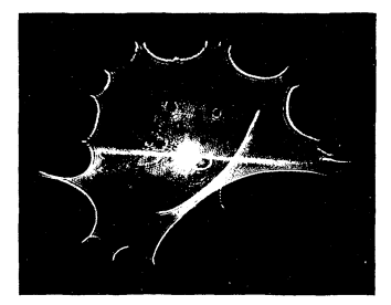
Caustics formed in the far field by a broadened laser beam incident on a water drop 'lens'.

1979. 108 figs., 8 tab. VIII, 311 pages. Cloth DM 69,-; approx. US $40.80 ISBN 3-540-09463-6