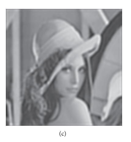
Figure 1: (a) The original image. (b) The noisy image. (c) The recovered image.

Remark 9. For Theorem 3, the sequences R_0, R_1, R_2, \ldots are orthogonal to each other in the finite dimension matrix space R^{n\times n} ; it is certain that there exists a positive number k+1 \le n^2 such that R_{k+1}=0 . So without the error of calculation, the first stopping criterion in the algorithm will perform with finite steps. From Theorem 8, we get A^TAX_{k+1}BB^T-A^TCB^T=0 . According to Theorem 1, when we set \lambda^*=0 , X_{k+1} is a solution of the problem (3).